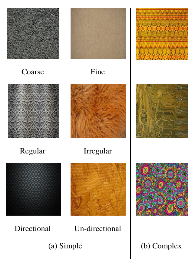
Fig. 1. Images of Simple & Complex Texture

from the presence of only a single color or intensity. The different texture properties as perceived by the human eye are, for example, regularity, directionality, smoothness, and coarseness, see Fig. 1.