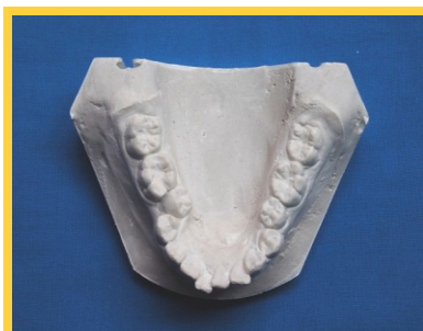
Figure 3: Day one of bonding (D1) and after placement of multistranded stainless steel wire (Group B)