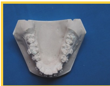
Figure 3a: After decrowding (D2) using multistranded stainless steel wire (Group B)