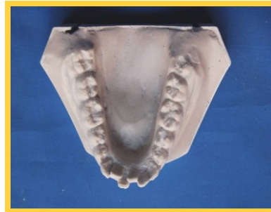
Figure 2: Day one of bonding (D1) and after placement of NiTi wire (Group A)