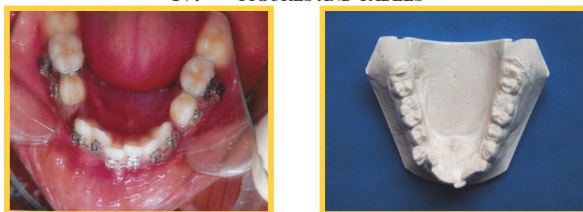
Figure 1: Day one of bonding (D1) and after placement of NiTi wire (Group A)