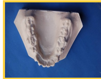
Figure 2a: After Decrowding (D2) using NiTi wire (Group A)