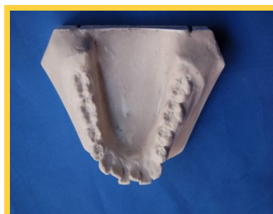
Figure 4: Day one of bonding (D1) and after placement of multistranded stainless steel wire (Group B)