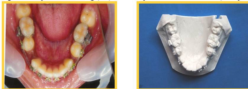
Figure 1a: After decrowding (D2) using NiTi wire (Group A)