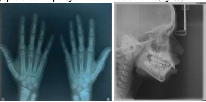
FIGURE 4 FIGURE 5 (Both the figure shows no abnormality related to delayed bone growth)

A hand-wrist radiograph and lateral cephalogram revealed no abnormalities (fig 4, 5).