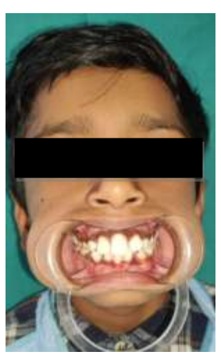
FIGURE 1 (Intra-oral figure showing a mega central incisor in upper front tooth region)

At the clinical extraoral examination the facial profile appeared to be convex. The lips were incompetent because of the mega central incisor (fig 1). Also, an abnormal tooth eruption pattern was noted. There were no signs of temporomandibular joint problems. A solitary upper central incisor and mixed dentition were discovered during the intraoral examination. During the intraoral examination, it was discovered that the patient had a 7-8mm overjet, bilateral angle's class malocclusion, lower anterior crowding, and no crossbite. Only a few teeth showed pre-shedding mobility; no signs of dental caries were discovered. It also demonstrated indistinct philtrum. There was no maxillary labial frenum. Prominent incisive fossa was seen. A very noticeable midpalatal ridge was also observed (fig 2,3).