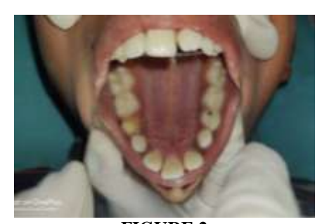
FIGURE 2 (Intra-oral figure showing maxillary arch with single central incisor in the mid with adjacent tooth, and midpalatal ridge can be evidently seen)

DOI: 10.9790/0853-2206050613 www.iosrjournal.org 7 | Page