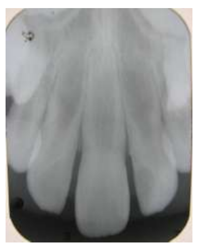
FIGURE 9 (Intraoral periapical radiograph shows single central incisor with apex open)