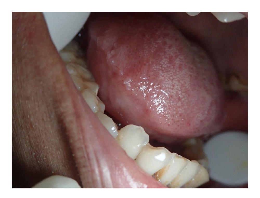
Figure 2 the swollen tongue