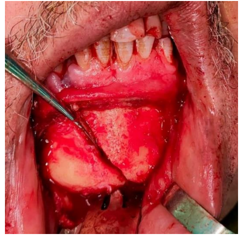
Fig. (1) fracture line

After stabilization of the fractured segments introduction of 3 dimensional plate was done. Fixation of the 3D plate was done with 2mm monocortical screws at the superior bar and bicortical screws at the inferior bar in such a way that a horizontal bar is perpendicular and a vertical bar is parallel to the fracture line. In the symphysis and para symphysis regions, the upper bar was placed in the sub apical position.