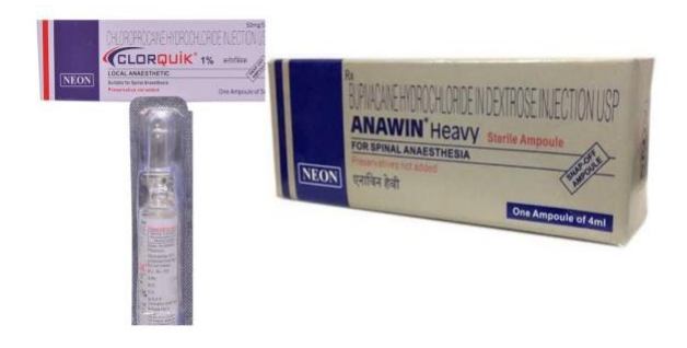
Figure 1- chloroprocaine and Bupivacaine ampoules