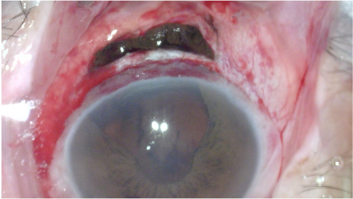
Figure 03: Intraoperative photo showing a superior paralimbic scleral rupture with herniation of the iris.

AKANNOUR YOUNES, et. al. "Ocular Rupture Associated With Lens Dislocation to the Subconjunctival Space." IOSR Journal of Dental and Medical Sciences (IOSR-JDMS) , 22(3), 2023, pp. 37-38.