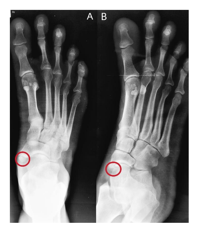
Fig.1A and B: Plain radiograph of the right foot AP(A) and Oblique(B) views showing Accessory navicular bone type II.