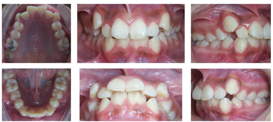
Fig. 2 Initial intraoral photographs.

In the intraoral analysis, the patient presented mismatched midlines, the dental fusion of d.o. #31-32 and #41-42, bilateral Cl molar relationship and indeterminate canine relationship bilaterally (due to the position of o.d. #13 and 23), square upper arch with severe crowding and ovoid lower arch with moderate crowding, overjet of 5 mm and overbite of 40% (Fig. 2).