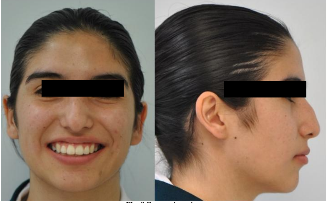
Fig. 8 Extraoral result.