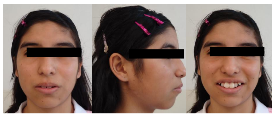
Fig. 1 Initial extraoral photographs.

In the extraoral photographic analysis, it was found that the patient presented a normocephalic biotype, with apparent facial symmetry, symmetrical superciliary line, proportionate eyes, symmetrical pupillary line, medium nose, lips and mouth, lip incompetence present, and symmetrical commissural line; increased lower third regarding the middle and upper third, convex profile, nasolabial angle of 97°, lips opposite Ricketts esthetic line and upper dental midline deviated 2 mm to the right concerning the facial midline (Fig. 1).