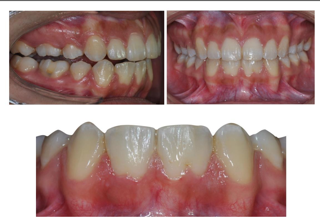
Fig. 7 Intraoral result, with canine guidance.