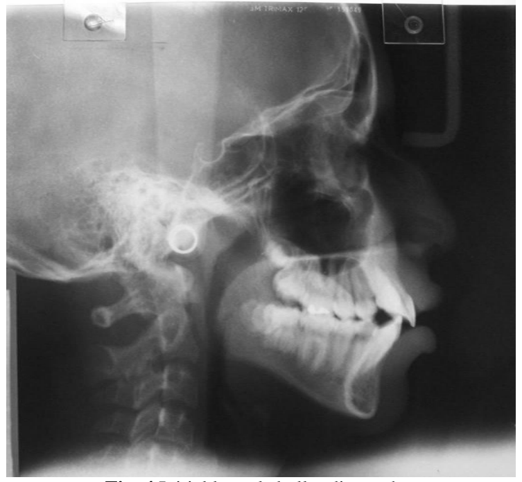
Fig. 4 Initial lateral skull radiograph.