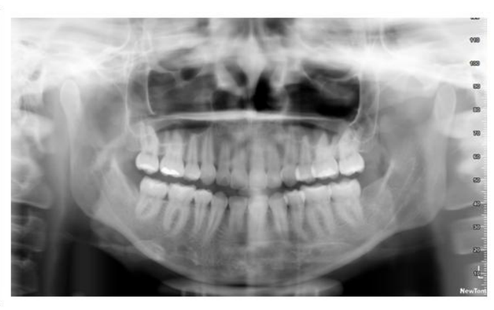
Fig. 9 Radiographic result.