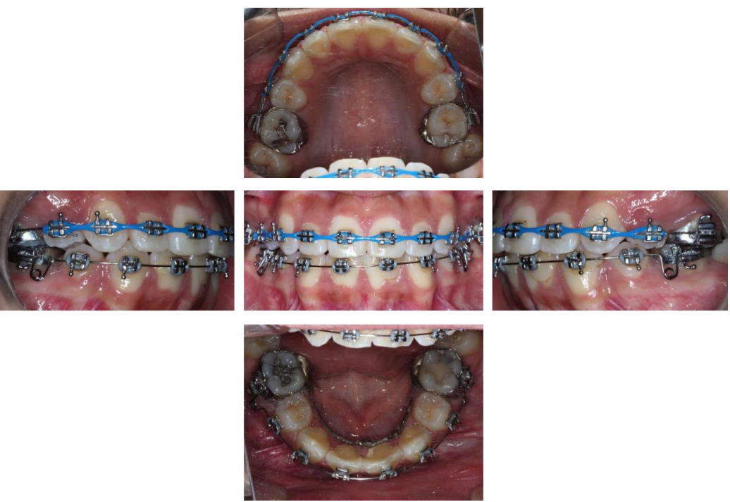
Fig. 6 Complete fixed appliances, lower tongue thrust appliance.