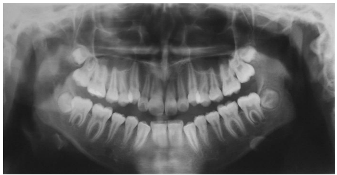
Fig. 3 Initial orthopantomography.

Cephalometry demonstrated a skeletal class II due to maxillary protrusion, vertical growth pattern, increased posterior facial height and proinclined upper and lower incisors (Fig. 4 and Table 1).