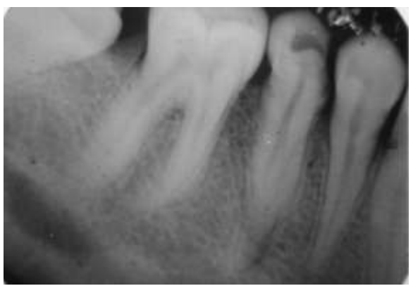
Fig. 1. Preoperative radiograph

Successful nonsurgical endodontic management of a mandibularsecond premolar with three root canals has been presented. It could be established that the presence of extra rootsand root canals in these teeth may occur far more than one can expect.