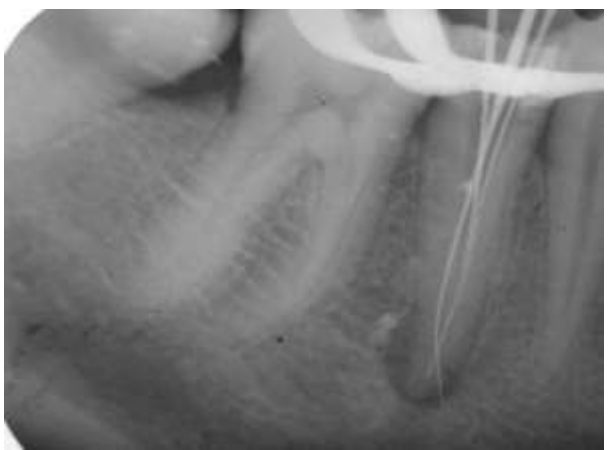
Fig. 2 Working length determination.