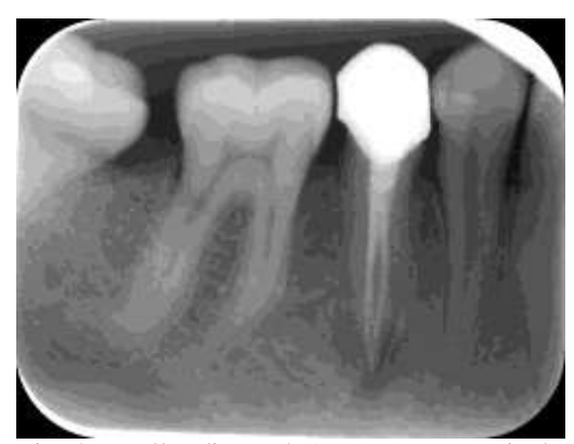
Fig. 4 Recall radiograph 1 year postoperatively