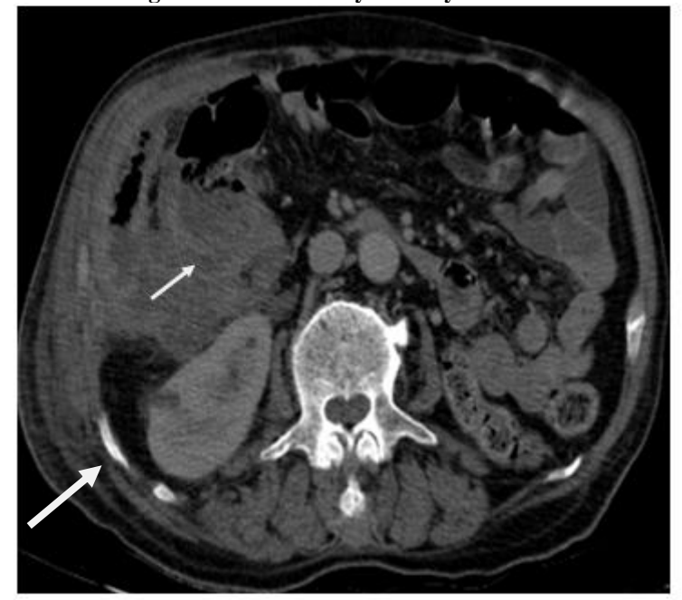
Figure 1: CT Scan Showing Fistula Between Hydatid Cyst And Colonic Tumor Thickening

Colonoscopy Showed A Large Tumoral Process Of The Right Colon That Was Bringing Hydatid Vesicles Typical Of Hydatid Disease (Figure 2). A Biopsy Was Performed .The Histological Type Of The Colonic Lesion Was A Moderately Differentiated Adenocarcinoma.