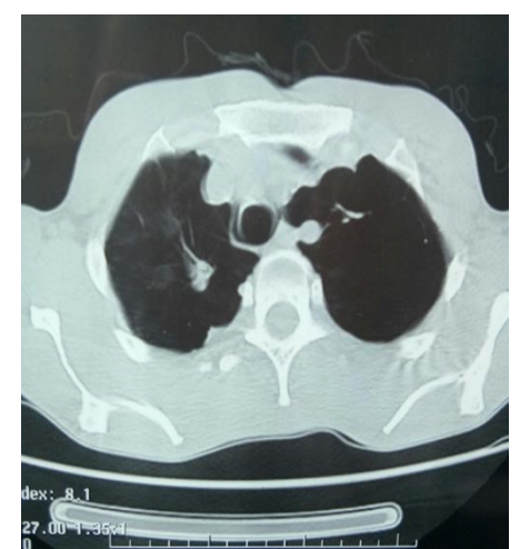
Figure 1.Chest X ray showing Bilateral Pneumothorax.Figure ! CT Thorax showing bilateral Pneumothorax. Right > Left.A bulla is seen in left side.