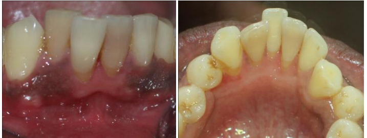
Fig 3:Labial and Lingual gingival changes on third visit (day 7)