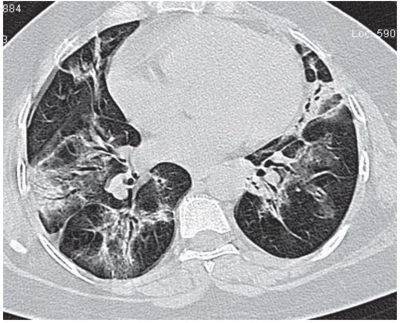
Figure-3: HRCT reveals extensive geographic areas of ground glass attenuation with septal thickening and focal areas of consolidation with air bronchograms. Changes are predominantly distributed in bilateral peribronchovascular, subpleural regions and lower lobes. Findings are in favour of cryptogenic organising pneumonia.

In our study the most common age group at presentation was 60 to 80 years with 25 patients including 17 females and 8 males.