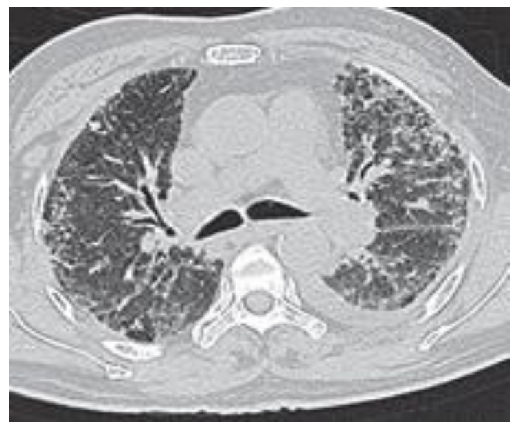
Figure-2: HRCT shows bilateral diffuse interstitial lung disease in the form of interlobular and intralobular septal thickening predominantly in subpleural region with focal areas of tiny honeycombing with left sided pleural effusion. Findings are in favour of idiopathic interstitial pneumonia- nonspecific interstitial pneumonia.