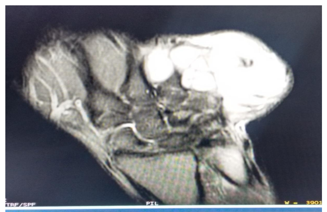
Figure2 MRI scan showing lobulated mass with altered signal intensity area in intramuscular plane of hand.