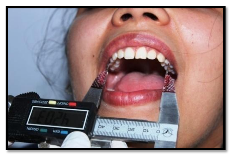
Figure 3 measuring the interpremolar width with an electronic vernier caliper

The data collected was subjected to statistical analysis and the SPSS software package version 19.0 (SPSS Inc. IBM Corporation, Chicago, IL, USA) was used.