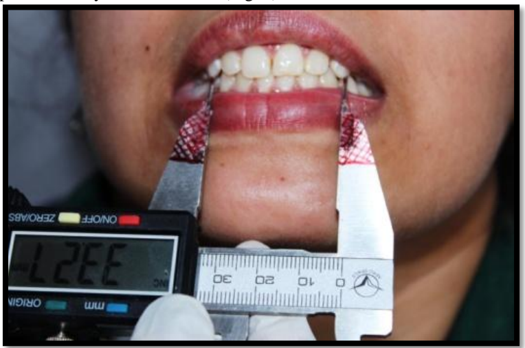
Figure 2 measuring the intercanine width with an electronic vernier caliper

Intercanine Width (ICW) was measured as the horizontal distance between the cusp tip of maxillary right side canine to the cusp tip of maxillary left side canine (Fig. 2).