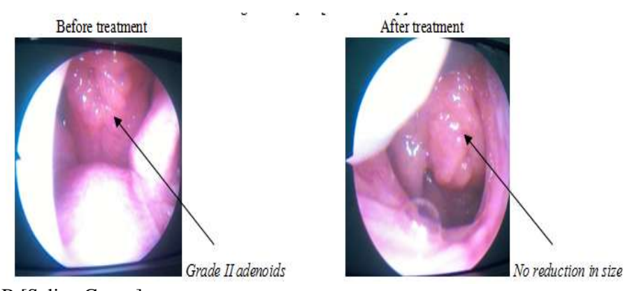
Fig. 3 Group B [Saline Group]