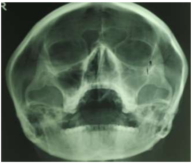
Figure 1: X-Ray PNS showing left side opacifications in maxillary sinus