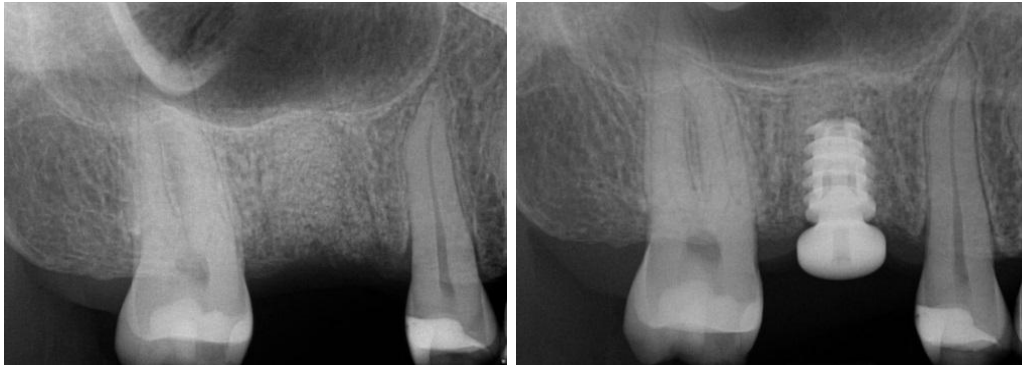
Fig 1; Pre-operative radiograph.

Osseointegrated dental implants are an effective alternative in the rehabilitation of partial or total edentulous patients [1]. Both the need and increase of using treatments associated with dental implants resulted from the combined effect of several factors, such as: population aging, tooth loss related to age, anatomical consequences of edentulism, unsatisfactory performance of removable dentures, psychological aspects of tooth loss, and advantages of implant-supported dentures [2]. Short dental implant placement is an alternative treatment modality to bone grafting procedures [2]. Moreover, short implants may present results similar to those of longer implants [3]. An implant is considered as short when presenting a length smaller than 10 mm [2]. Accordingly, in clinical situations with little bone availability, short implants are a viable, simple, and predictable alternative [3].