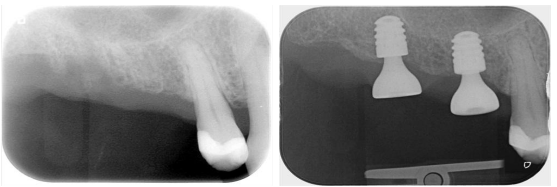
Fig 3; Pre-operative radiograph.