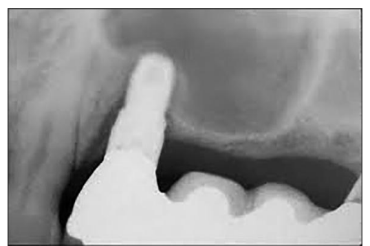
Fig 7: failing maxillary short implant used as distal abutment for long span bridge

Also, implants installed into alveolar sockets immediately after tooth extraction have been shown to yield predictable outcomes [20]. The use of this procedure reduces the number of surgical sessions and may also reduce the time between surgery and prosthetic delivery [28]. For this placement modality the need for implants that are longer than the remaining extraction sockets has been propagated under the assumption that implant stability may be guaranteed in the area beyond the apex of the extraction socket [29]. However, because of the presence of anatomical structures such as the maxillary sinus or the inferior alveolar nerve, bone may not be available beyond the apex of the socket. Therefore various investigators have studied effectiveness of short implants placed in animal models and have found promising results in immediate extraction sockets [30]. Fig.8