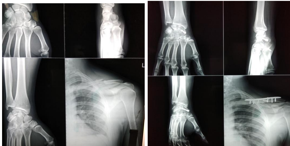
Radiograph showing fixation of clavicle fracture with associated opposite side scaphoid fracture