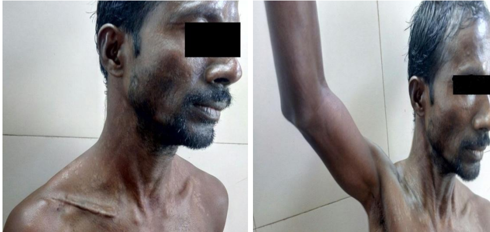
Patient showing hardware prominence but satisfactory shoulder movement