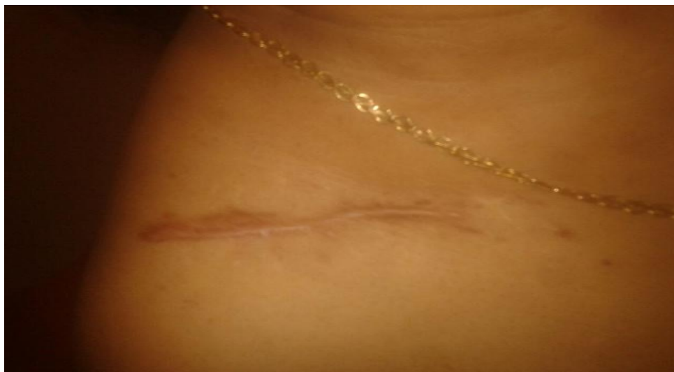
Post surgical scar hypertrophy in a female patient