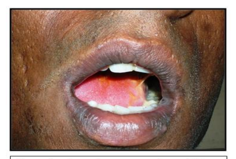
Figure showing copious amount of pus discharge seen intraorally

Skin overlying the swelling was warm. Patient was unable to open mouth. Mandibular left third molar was partially visible in the oral cavity. Intraoral pus discharge was evident from mandibular left third molar region from buccal as well as lingual side.