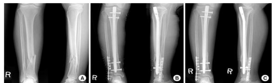
case2 Fibula non fixation case