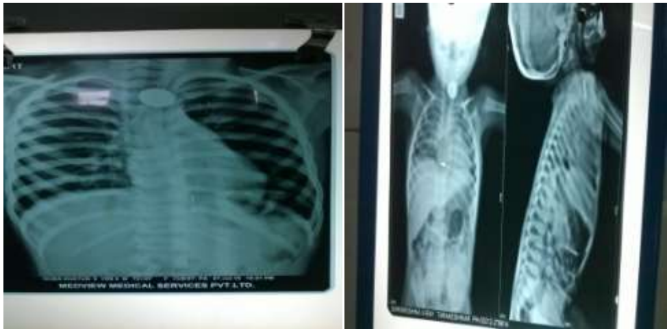
Fig1:Chestxray PA view showing

This study gives an overview of incidence amongst foreign bodies in aerodigestive tract. The childhood age group below 11 yrs is most commonly affected. In our study coin followed by meat bone are the most common foreign bodies in digestive tract while cricopharynx is the most common site of impaction. Hypopharyngoscopic removal under general anaesthesia is the most common intervention done. In case of radiolucent foreign bodies in digestive tract, the examination with flexible endoscope prior rigid oesophagoscopy is preferred to detect the foreign body. Among the airway foreign bodies the pea, a vegetative foreign body was found to be the most common. The most common site of lodgement is right main bronchus and rigid ventilating bronchoscopy under general anaesthesia with retrieval through optical forceps is most commonly done. Negative radiological finding does not rule out foreign bodies. Meticulous history and thorough examination are the key factors to guide us for prompt management. This study also highlights the nature of foreign bodies most commonly encountered in children are coin which is not suitable for their age. This above fact points us to the fact that proper educational strategies to parents and safe childhood behavior are some of the ways to prevent this kind of surgical emergencies.