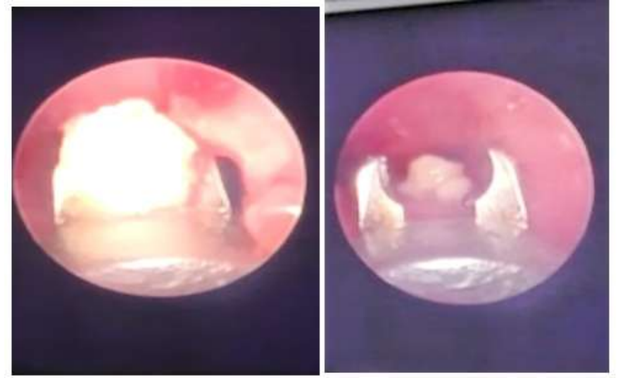
Fig 13,14: Removal of walnut and peanut from rtmain bronchus and trachea respectively