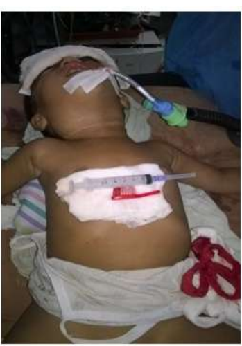
Fig8:Foreign body after removal