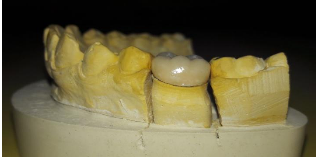
Figure 5: Margins of Endo Crown verified on master die cut cast before final leuting.

DOI: 10.9790/0853-1601022933 www.iosrjournals.org 31 | Page