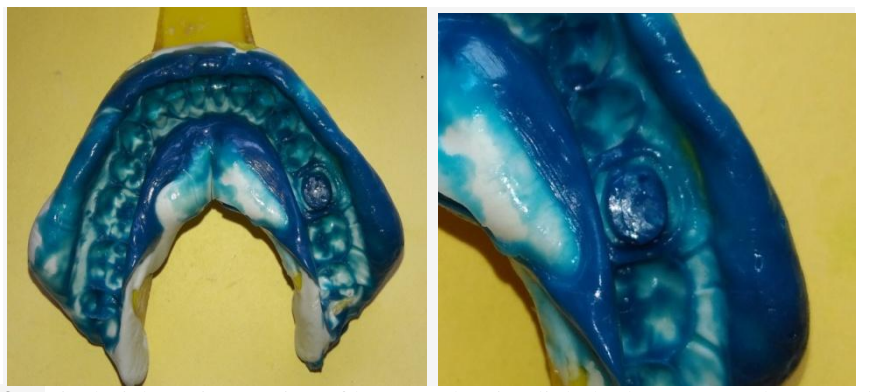
Figures 3a & 3b: Final Pick Up impression of lower arch using light body Putty Wash Impression technique showing prepared 36.