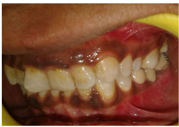
Figure 6: Buccal view of tooth 36 depicting the occlusion and imperceptible margins.