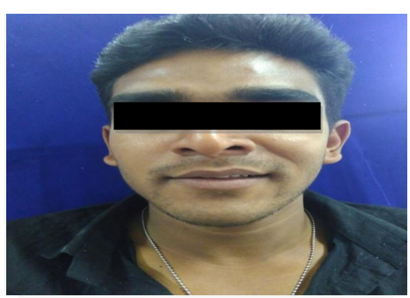
Figure 7: Post operative Smile on follow up visits.