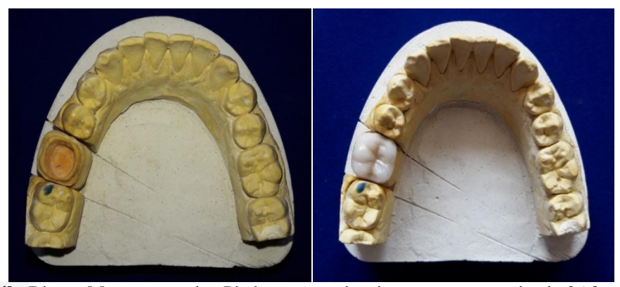
Figures 4a & 4b: Die cut Master cast using Pindex system showing crown preparation in 36 for receiving Endo Crown