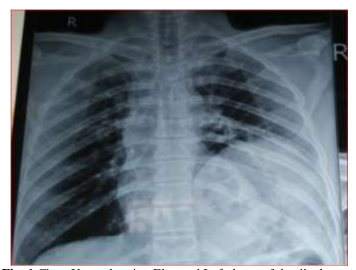
Fig.1 Chest X ray showing Elevated Left dome of the diaphragm