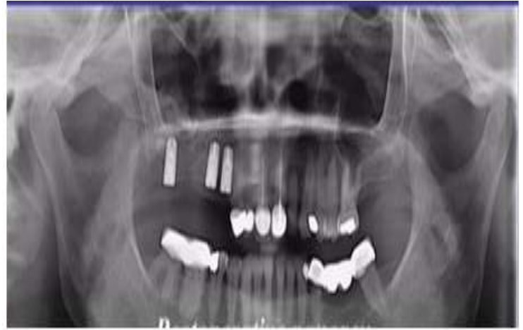
Figure 14 immediate post operative OPG