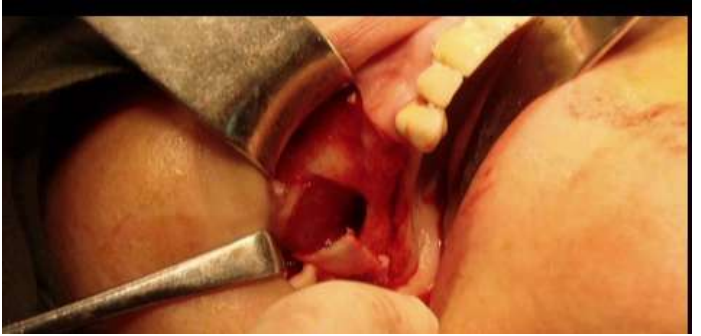
removal of lateral window