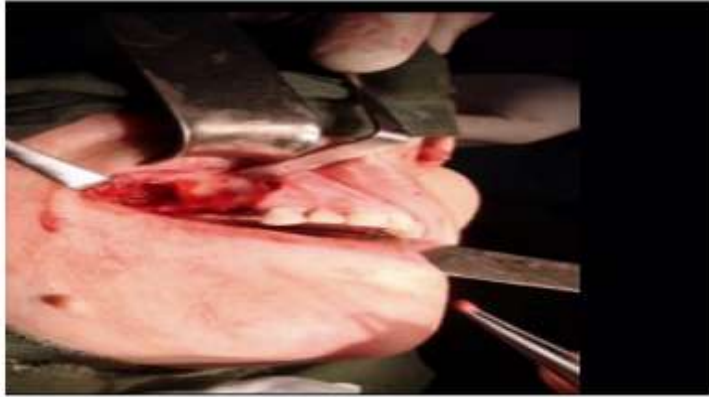
Figure11 allograft cerabone was used to fill the lateral window after implant placement