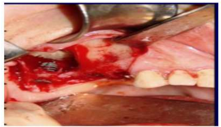
Figure 10 implants placed simultaneously