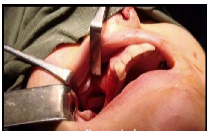
Figure 9 block bone used to elevate the sinus membrane