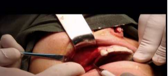
Figure 2 intra oral view showing the residual alveolar ridge after elevation of flap