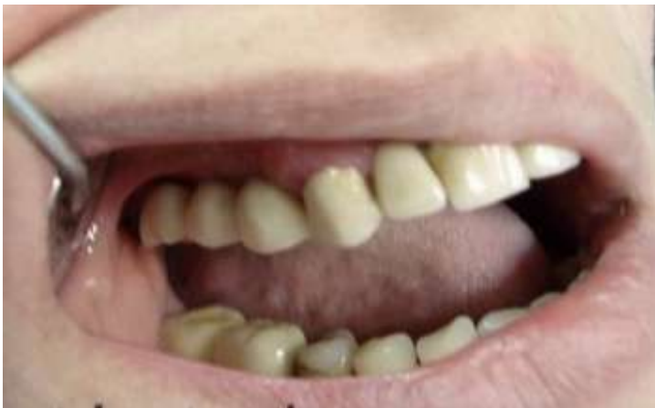
Figure16 final prosthetic procelin crowns placed