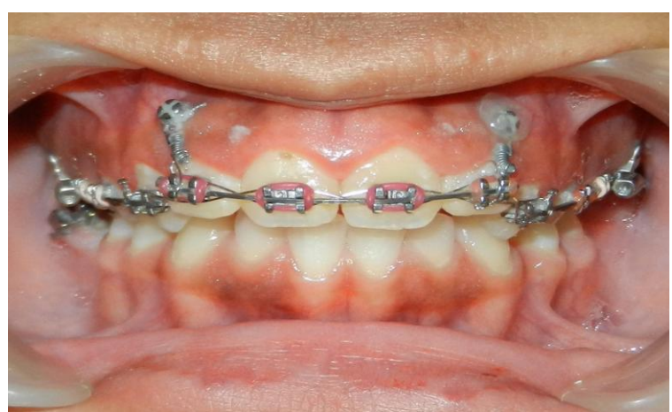
(Fig. 3) Maxillary incisors intrusion using miniscrews (end of treatment)

\begin{array}{l} 1. \ U1-VCP, \ 2. \ CR-VCP \ , \ 3. \ U6-VCP \ , \ 4. CR-VCP \ , \ 5. \ U1PP, \ 6. \ CR-PP \ , \ 7. \ U1-HCP, \ 8. \ CR-HCP \ , \ 9. \ U6-PP, \ 10. \ CR-PP \ , \ 11. \ U6-HCP \ , \ 12. \ CR-HCP \ , \ 13. \ U1-PP^0, \ 14. \ U1-SN^0, \ 15. \ U1-HCP^0, \ 16. \ U6-PP^0, \ 17. \ LS-Eplane \ , \ 18. \ LI-Eplane \\ \end{array}