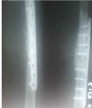
Figure 2 : showing complete radiological union with LCP in-situ at 17 weeks.

There were no intra-operative or immediate postoperative complications. However, there were late complications in the form of two cases of broken implant which was seen in mid diaphysis fracture, one case of superficial infection and one case of screw loosening in distal third fracture. The broken implant cases had to be re-operated with removal of the implant and internal fixation with longer plate and fibular grafting was done. Others were treated conservatively as fracture was healing. Figure 3 showing implant failure with broken plate in-situ.