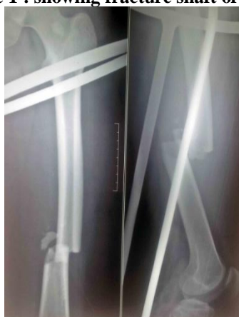
Figure 1 : showing fracture shaft of femur.

Clinical union was seen at a mean time of 16.1 weeks. The duration for supra-condylar fracture was 14.5 weeks and for mid-diaphysis it was 16.6 weeks. Radiologically, bridging callus was seen at 12-16 post operative weeks and mean time to complete radiological union was 18.3 weeks. For supra-condylar fracture it was 17.1 weeks and for mid-diaphysis 19 weeks. This is shown in table 1. Figure 2 showing complete radiological union with LCP in-situ.