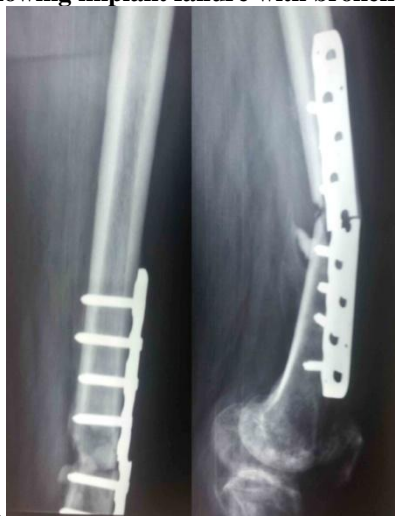
Figure 3 : showing implant failure with broken plate in-situ

Based on the assessment parameters (Modified Sanders) [10] used in this study, 27 patients (90%) had excellent to good, 3 patients (10%) had fair to poor outcome in the final result. This is illustrated in table 2 and figure 4. Figure 5 showing complete ROM knee.