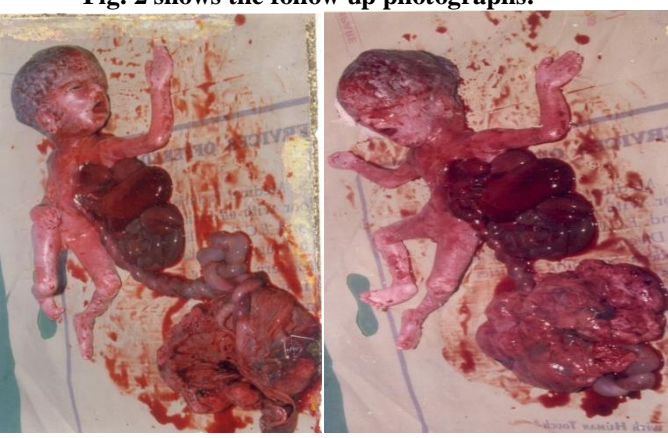
Fig. 2 shows the follow up photographs: