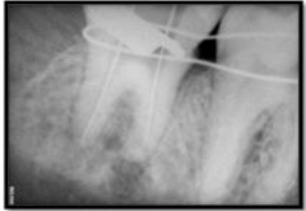
Fig. 7(a): working length determination