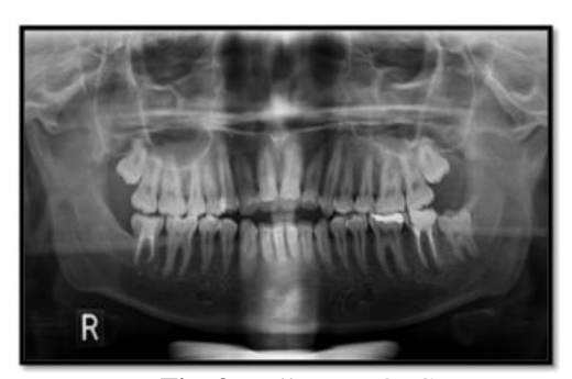
Fig. 9: Follow-up OPG