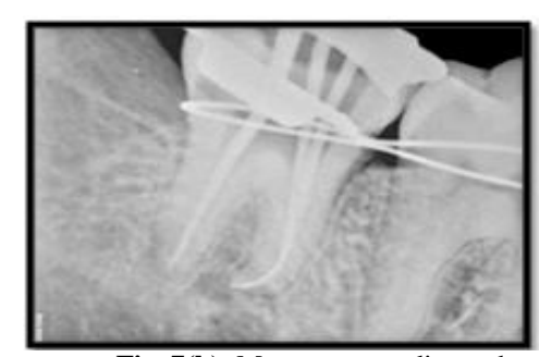
Fig. 7(b): Master cone radiograph