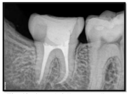
Fig. 10: 6 month follow-up radiograph