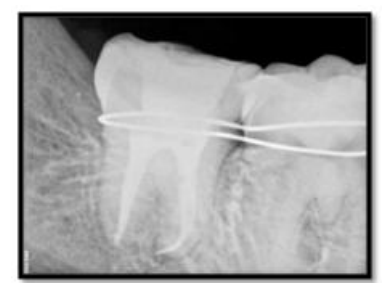
Fig. 8: Post-obturation radiograph