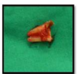
Fig. 4: Atraumatic extraction of 47