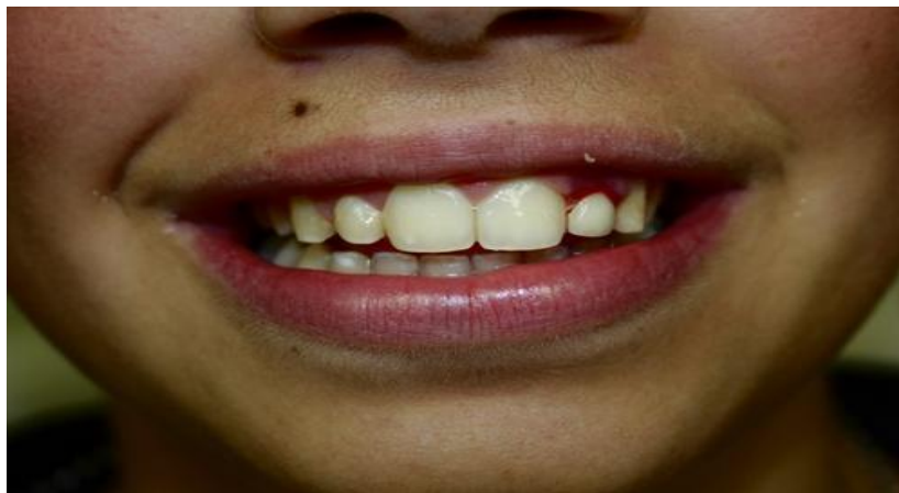
Fig.4. Post -op crown cemented with temp cement Patient is scheduled in 2 weeks for follow up

The implant was allowed to osseointegrate for a period of 6 months, and a final impression was made using putty wash technique and a final prosthesis was fabricated . Prosthesis was tried in patient mouth and after checking the esthetics, the prosthesis was luted with GIC type 1 luting cement . Excellent esthetics and emergence profile were obtained through this technique .