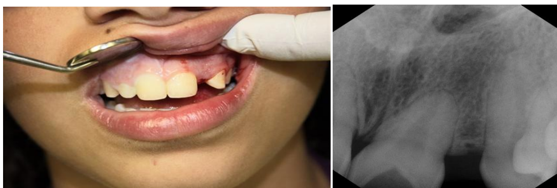
Fig.1a,b; (a) Missing #10. Short clinical crown #7.Diastema between #9 and 11(b) Pre-op periapical radiograph. #9 angled slightly distally, #11 slightly mesially

A 15 years old Arab girl was seen in private orthodontic clinic in Israel . She was an intelligent, college student, co-operative, and conscientious about her oral health and aesthetics. The patient was undergoing an active treatment of orthodontic treatment for past years, the aim of which was to close the residual space between her upper anterior teeth. Examination revealed good facial symmetry profile complicated by the presence of class I malocclusion. The patient was in permanent dentition with unilateral congenitally missing maxillary lateral incisors and retained deciduous lateral incisors. The maxillary arch presented with spacing between anterior teeth and in addition there was minor crowding of lower arch.