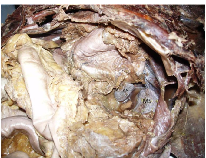
Fig3 Accessory spleen (AS) in situ