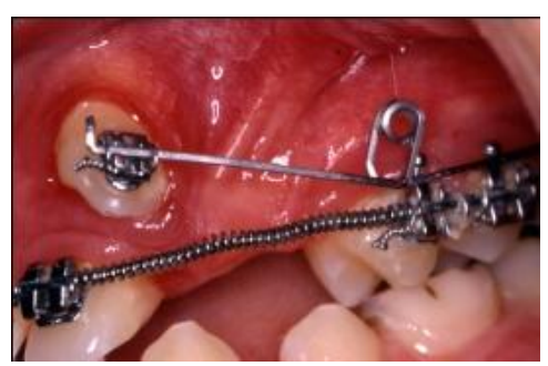
Figure 4: A coil spring was used to push the lateral incisor mesially and a segment arch with construction loop was used to move the canine distally