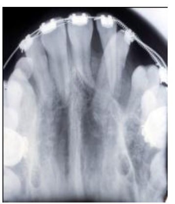
Figure 5: clinical situation during the treatment; incomplete canine lateral incisor transposition