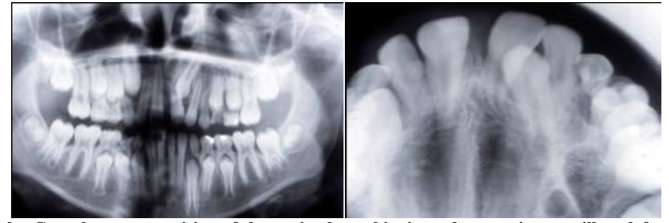
Figure 2a, b: Complete transposition of the canine lateral incisor, the erupting maxillary left permanent canine was observed between the roots of the central and lateral incisors