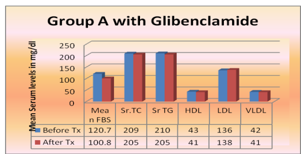
Fig no.1: Group A showing Mean Serum levels before and after treatment