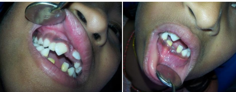
Fig 2: Upperbuccal sulcus