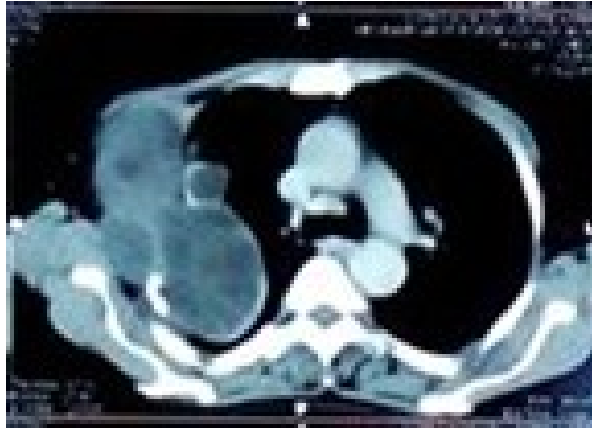
figure2. Chest CT showing the multiloculated hydatid cyst