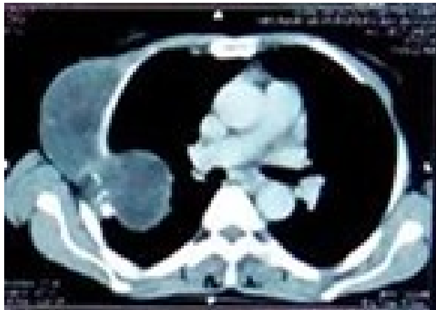
Figure 3. Chest CT showing extrathoracic extension of the hydatid cyst. This cyst was extrapulmonary , only abutting the lung parenchyma , not invading the lung.