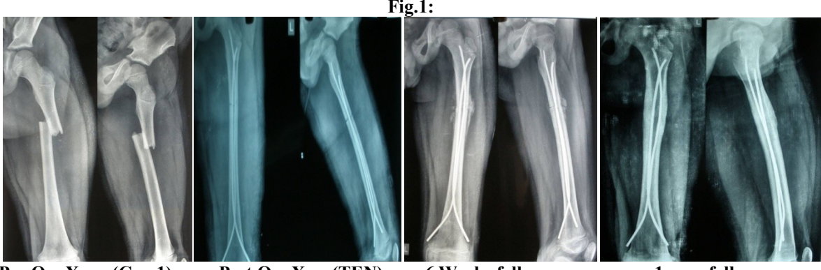
Pre Op. X-ray(Case1) Post Op. Xray(TEN) 6 Weeks follow up. 1 year follow up.

Radiological union occurred at an average of 8.5 weeks. Full weight bearing was permitted after elicited clinical non tenderness over the fracture site at an average of 9 weeks. Mobilization was permitted at an average of 5<sup>th</sup> Post op. day. 3 cases were mobilized at slight delay because of associated co morbidities at 1 week and 12 cases were mobilized at 3-4<sup>th</sup> Post Operative day. Limb length discrepancies were <5mm in all the cases. Limb Lengthening were observed in 12 cases which were less than 5 mm; whereas shortening were observed in 3 cases which were also less than 5 mm and clinically non significant; at the union time (TABLE 2). No clinically significant varus / valgus/ other angulation in any cases. Then when we called them 6-12 months postoperatively 12 cases were contactable and came for evaluation with radiologically consolidated and remodeled fracture (Fig.1, Fig.2).No clinically significant angulations. Limb length discrepancies found same as stated above. Average range of motion were almost full extension upto normal flexion i.e. more than 120 degrees. No case had any signs of infection. In one case prominent tip of Titanium Elastic nail was found protruding just beneath the skin over the anterolateral part just above the knee and patient subsequently was taken for implant extraction.