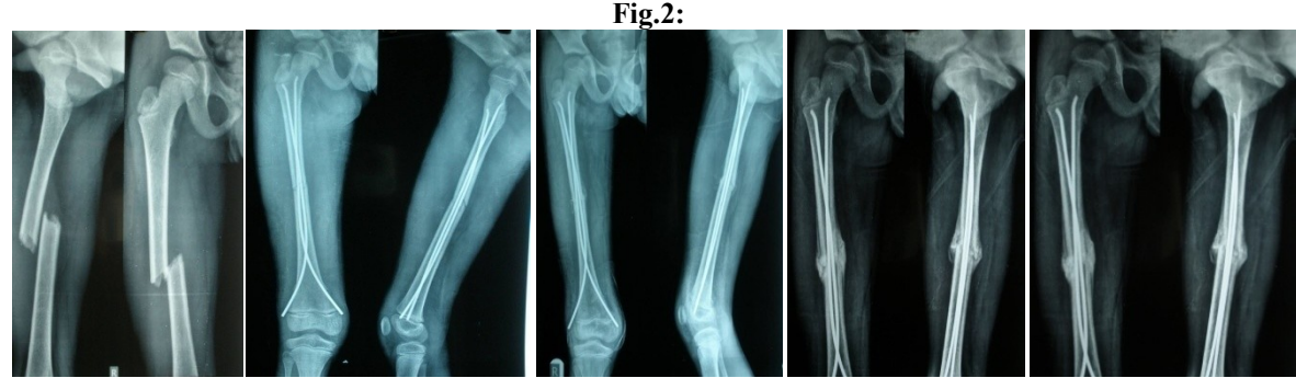
Pre Op. X-ray(Case 2) Post Op. Xray 4 weeks follow up. 8 weeks follow up. 10 weeks follow up.