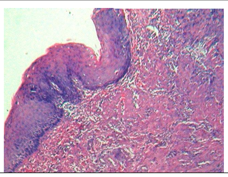
Fig 4: H&E X400 squamous epithelium lining the endometrium showing mild dysplastic changes