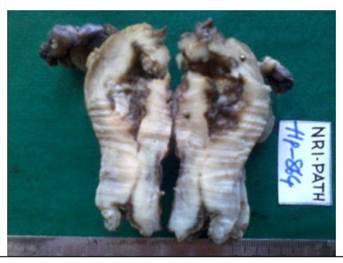
Fig 1: Cut section showing widened endometrial cavity and the surface showing multiple tiny grey white nodules.