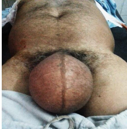
FIGURE 1 image showing bilateral ICD tubes and pneumoscrotum

The aim of presentation of this case is that after blunt thoracic trauma one needs to be alert and aware when dealing with scrotal swelling that the primary source of air can be located in the thorax which may be managed by chest tube insertion.