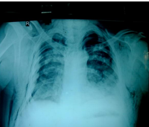
FIGURE 2 chest x ray showing bilateral pneumothorax with bilateral multiple rib fractures