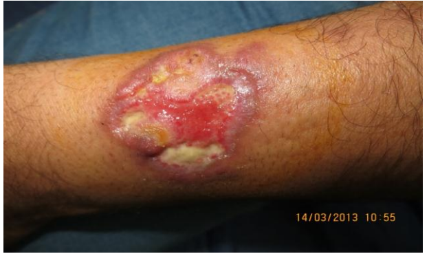
Figure 1. Twenty five years old male, showing ulcerative skin lesion of leishmaniasis in the left fore arm.