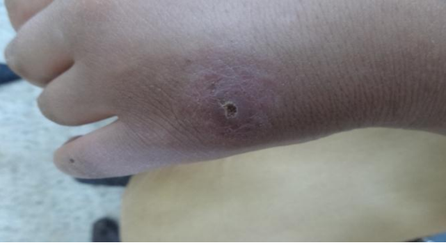
Figure 2. Eighteen years old male showing dry skin lesion of leishmaniasis on the dorsum of the left hand.

Figure 1. Twenty five years old male, showing ulcerative skin lesion of leishmaniasis in the left fore arm.