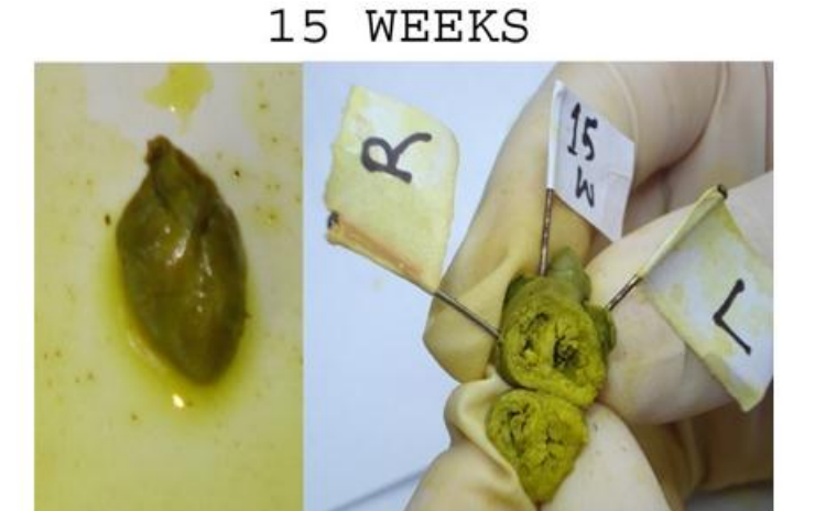
Fig.3. fetal heart of 15 weeks showing ventricular thickness cut just below the coronary sulcus.