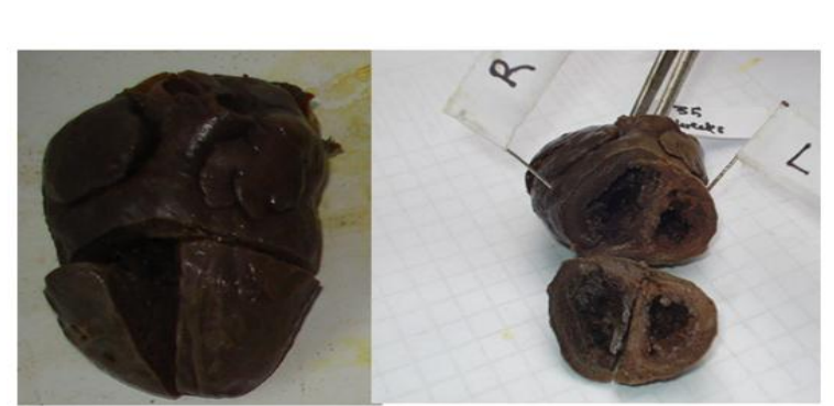
Fig. 2- heart of 35 weeks showing ventricular thickness cut just below the coronary sulcus.