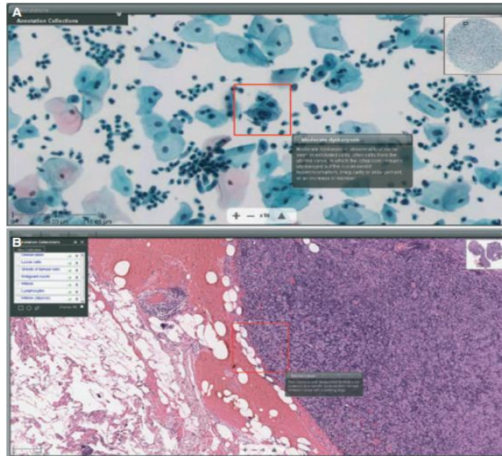
Fig.2. An example of annotations, showing how key features can be digitally marked and labeled on the slides. By clicking on an annotation label from the list (top left hand corner), the software relocates to that region of the slide, showing the important region of interest. Note also the thumbnail overview of the slide in the top right hand corner of the screen. (Adopted from: Peter W. Hamilton et al, APMIS 120: 305–315)