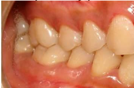
Figure 3: Pre- operative