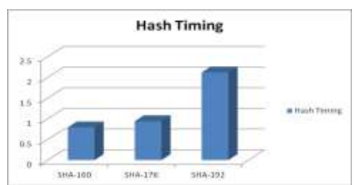
Fig.2 Execution time (in Seconds) comparison between SHA-160, SHA-192 with SHA-176