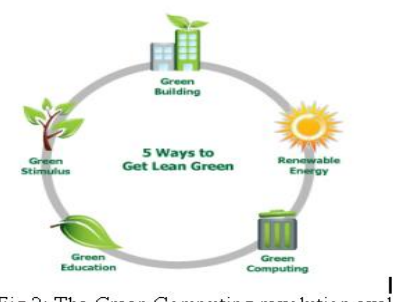
(Fig 2: The Green Computing revolution cycle)

Sun created a Sun Eco office to oversee all of the company's green programs, including telecommuting but also core products such as low-power servers.