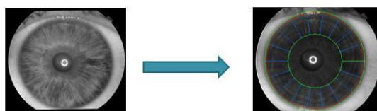
Fig2. Example of Edge Detection [7]

Segmentation is one of the important steps in preprocessing since it separates the input iris image into several components making it feasible to extract features easily. The Segmentation process is defined as separating the input iris image into several components, so it is very important step in preprocessing because it describes and recognize the input image. One of the best ways to separate the pupil from the whole eye is using circular Hough transformation in order to find the circle of the pupil [7]. The pupil is the largest black area in the intensity image; its edge can be easily detected from the binary image by using a suitable threshold of the intensity image.