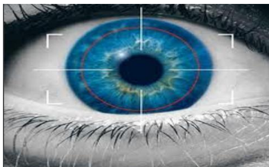
Fig1. Localization of iris

The first step in the localization process is pupil segmentation based on analysis of the histogram. It is assumed, like in [7] that a pupil is the darkest area in the image and standard deviation of luminance in this area is relatively low. It has to be emphasized that unwanted elements may appear in the threshold image. Nevertheless pupil can be segmented by relatively simple method, based on image thresholding using the histogram analysis.