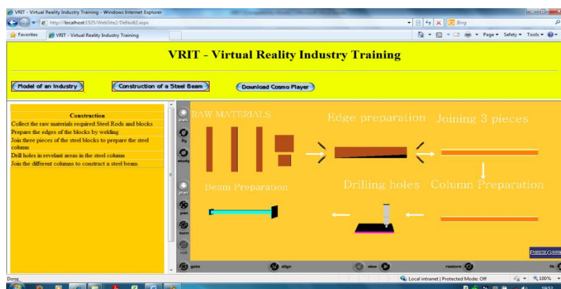
Figure 3. Construction of Steel Beam

Fig 3 shows the construction process of a steel beam.