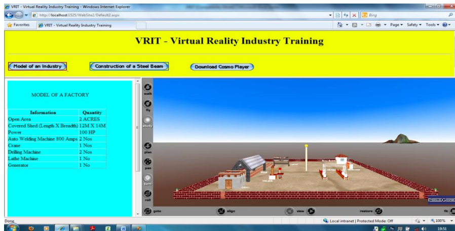
Figure 2. Model of a Factory

Fig 3 shows the construction process of a steel beam.