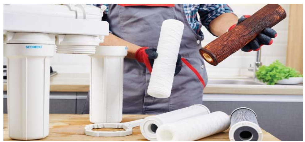
Figure 1: Water Purifier Service

as shown in Figure 1, and regular servicing of water purifiers is essential to ensure their optimal performance. However, managing service schedules, coordinating with service providers, and tracking maintenance history can be a complex task for users. The Water Purifier Service Supervision Mobile Application aims to simplify and access the supervision and management of water purifier services. By utilizing the power of mobile technology, this application empowers users to conveniently monitor, schedule, and track the servicing of their water purifiers, ensuring a continuous supply of safe and clean drinking water.