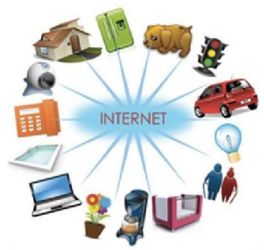
Figure: 1. Connected devices by internet exchanging data in our house hold

A Phenomenon in which everything has communicated to each other at anytime, anyplace with anyone is called "Internet of Things (IoT)" as shown in figure 1. It allows human and objects are communicate to each other through network, for example if we talk about our house environment then IoT is provided smart lighting, automatically locking & unlocking window, smarter TV, smarter dustbin every things