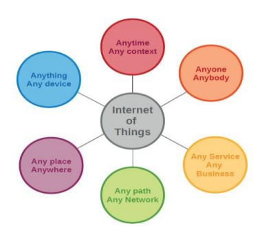
Figure 2. Varied are devices connected to IoT.

There are number of sad news for women "age no bar", said in the lighter scene they are more prone to attacks, this gives researcher and IoT team to make some gadgets for blind women security.