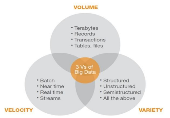
Figure: 2 Characteristics of Big data

Big Data mining refers to the activity of going through big data sets to look for relevant information. Big data sets samples are available in different fields like astronomy, atmospheric science, socialnetworking sites, life sciences, medical science, government data, natural disaster and resource management, web logs, mobile phones, sensor networks, scientific research ,telecommunications.